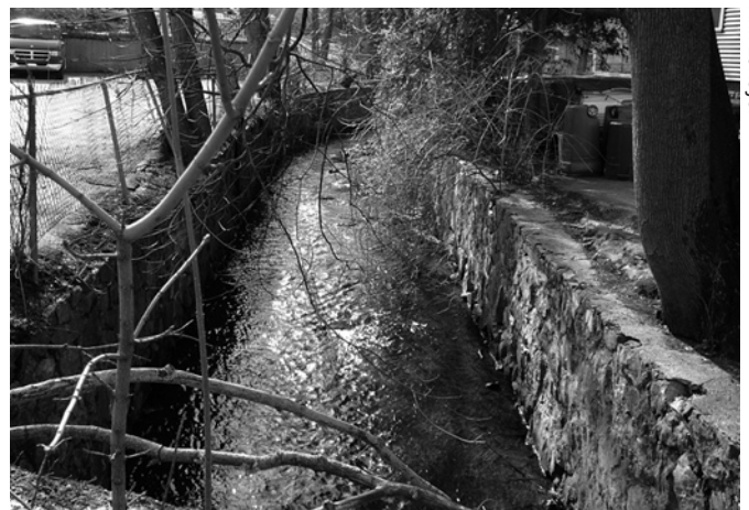
However, Mill Brook is channelized and inaccessible in many areas.

Five types of benefits could be realized from creating a linear park along Mill Brook with associated improvements: