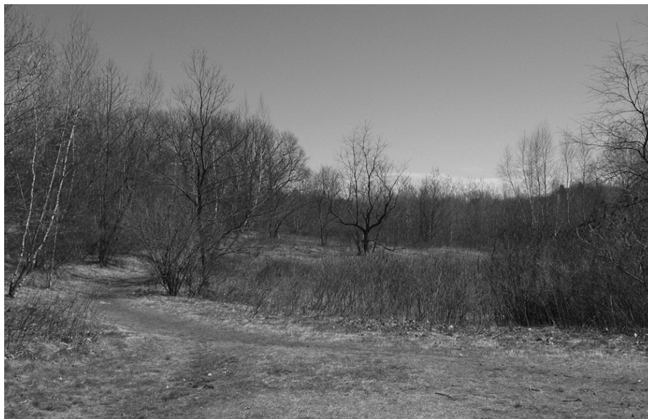
A meadow restoration plan is being prepared for parts of Arlington's Great Meadows.

An ongoing concern discussed in Frances Clark's Natural Resource Inventory and Stewardship Plan of 2001 is the natural succession of some upland meadow areas into woodlands. While that is a natural process, it creates a loss of meadow habitat and changes the