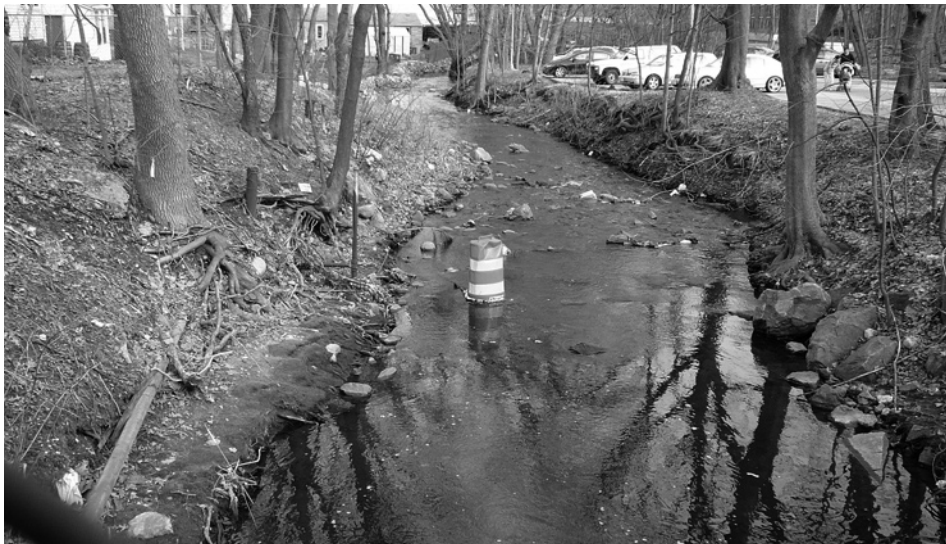
Some sections of the brook flow naturally through wooded areas that could be made more attractive and accessible.

Enhancement of and improved access to existing open spaces are key goals of the Town's Open Space and Recreation Plan, and recent projects at Cooke's Hollow (see related article) and Wellington Park brought renewed interest to the linear park concept. These are just two of the Town-owned facilities that abut Mill Brook, thus offering public entry points for greater access to the corridor. Other properties are the Arlington Reservoir, Hurd Field, Arlington High School and fields, Buzzell Field, Mt Pleasant Cemetery, and Meadowbrook Park.